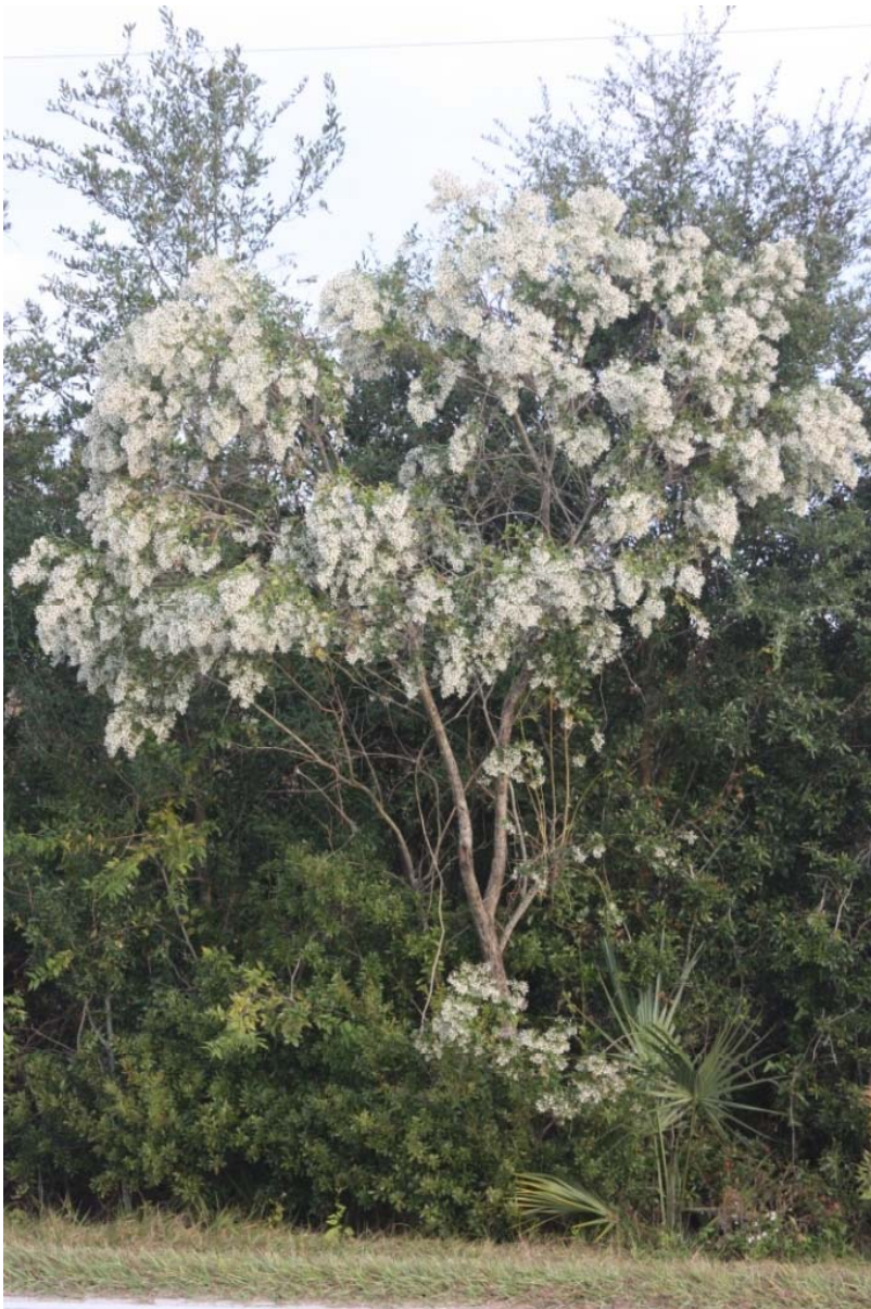
UF Campus, Gainesville