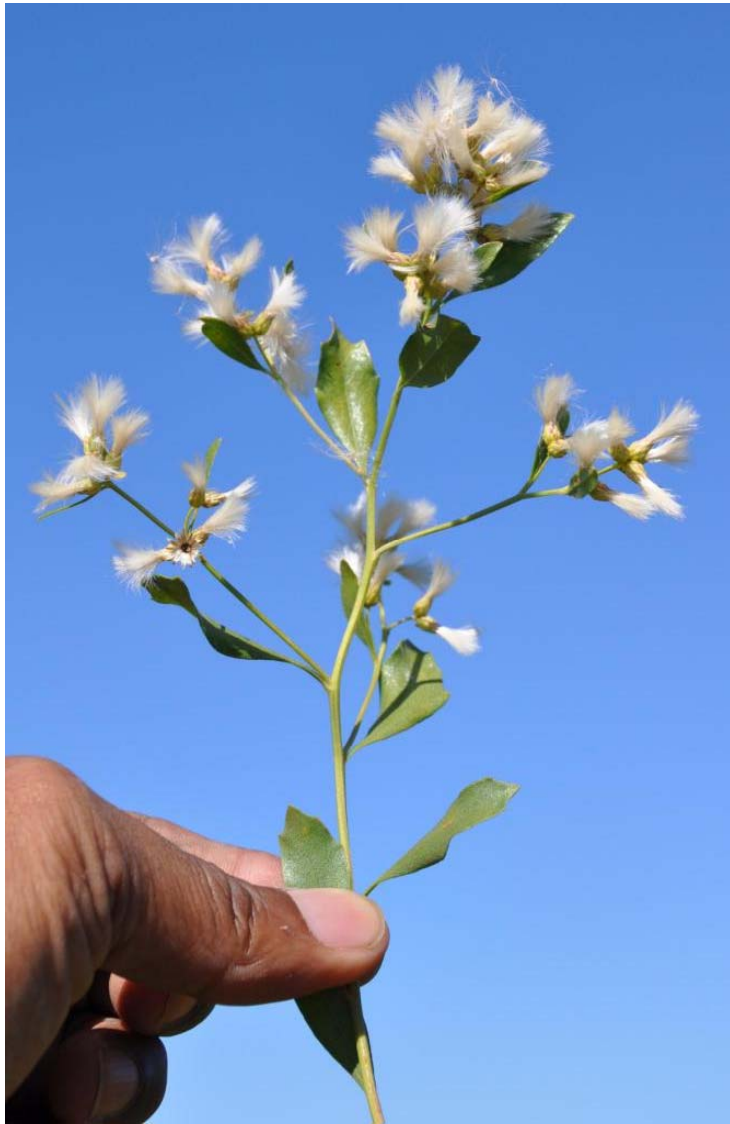
Stem with axillary shoots