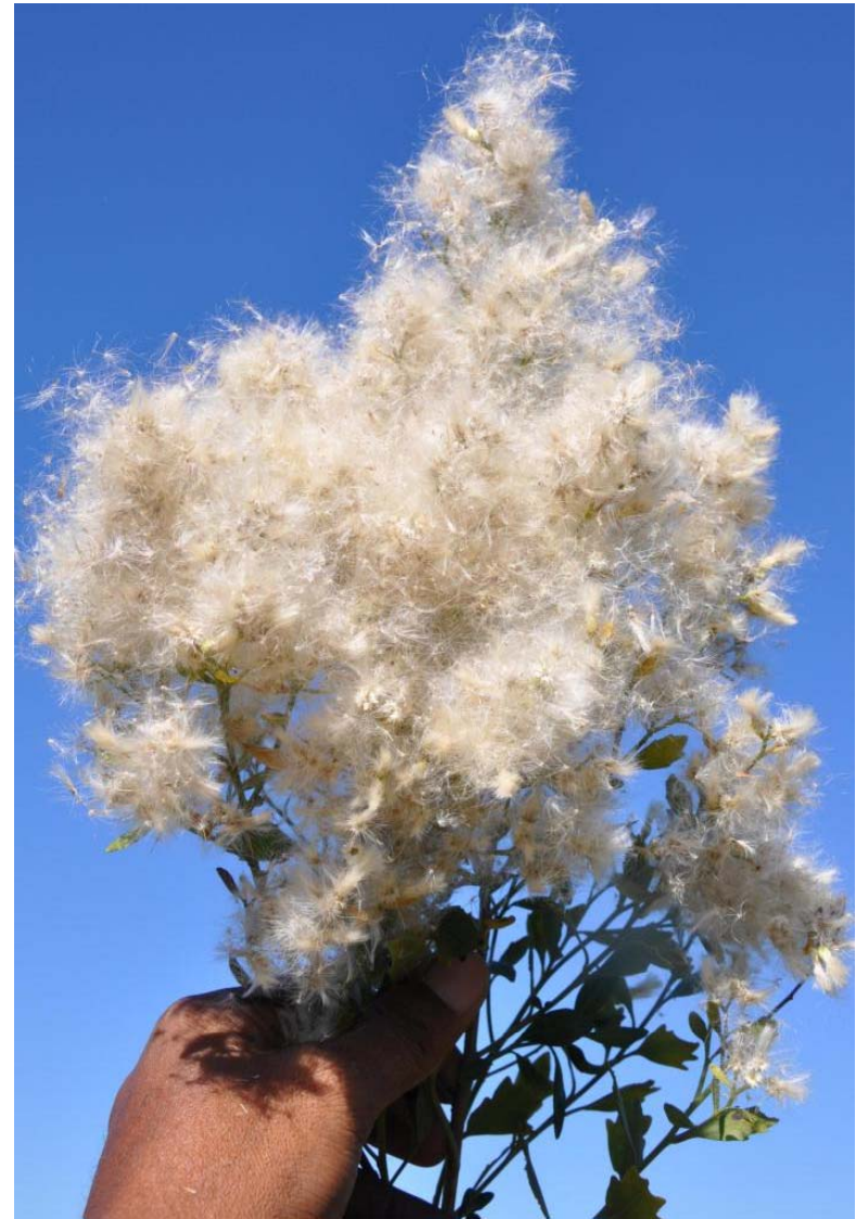
Numerous stems and the impending flight of pappi