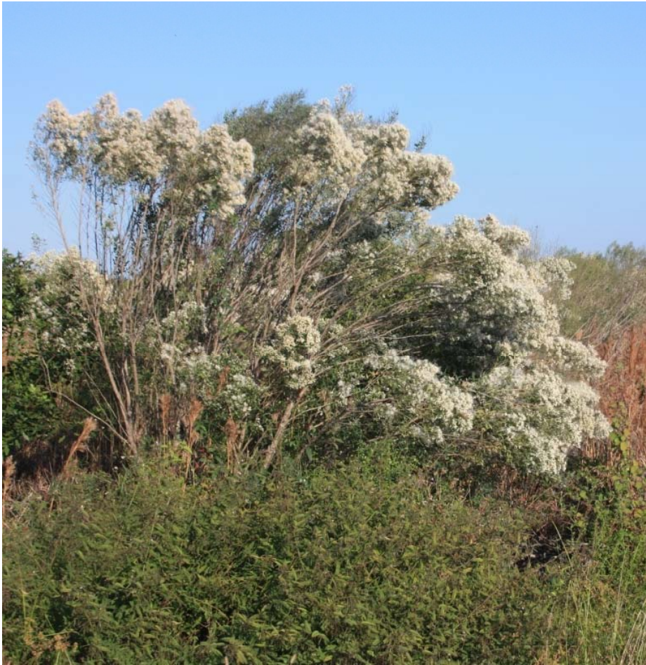
North Collier County