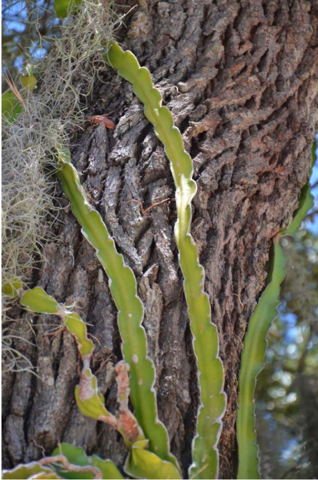
Leaves clinging to the bark of a live oak tree