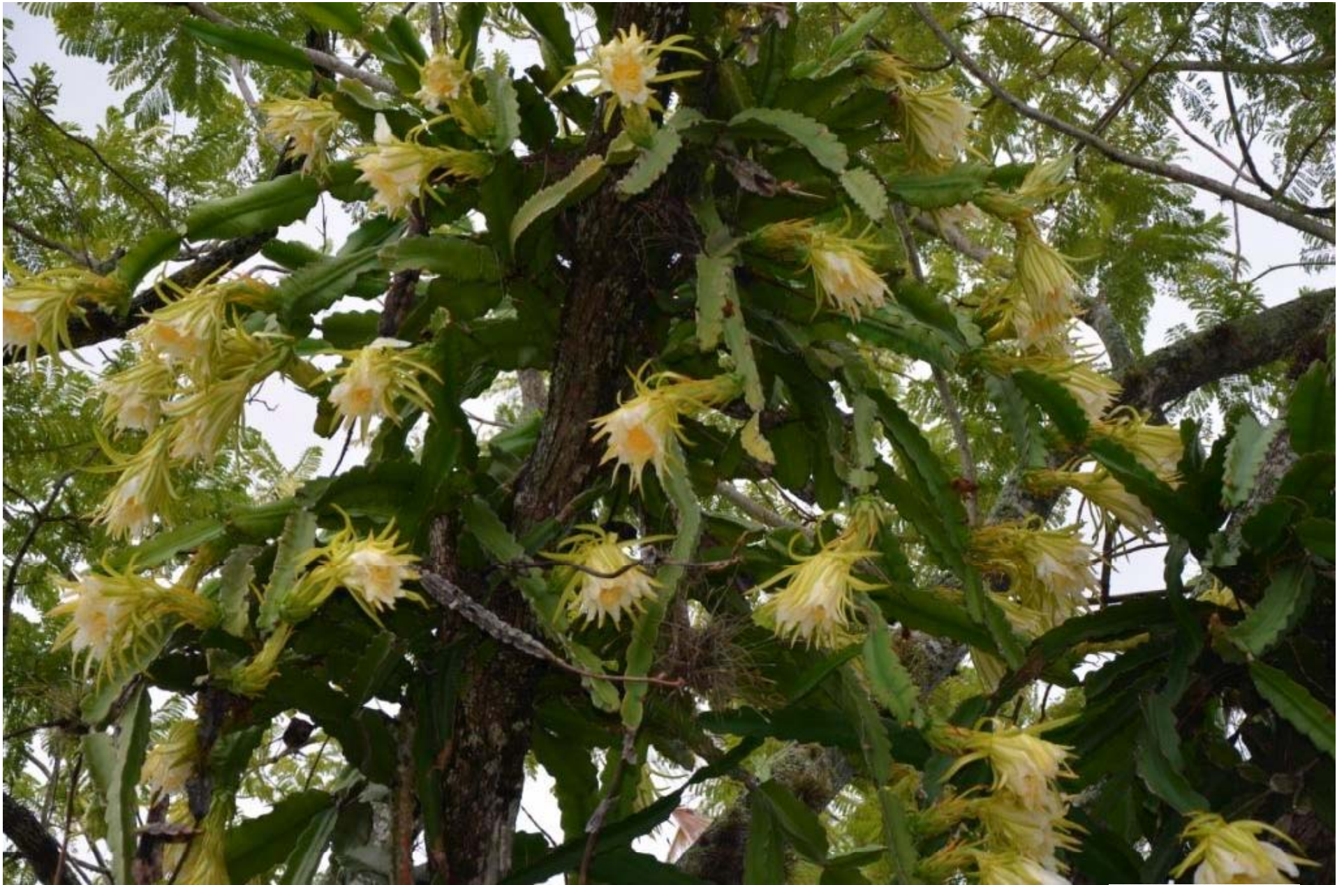
On Jacaranda, 27 August, 11:00 am on a cloudy day, Fort Myers, Florida