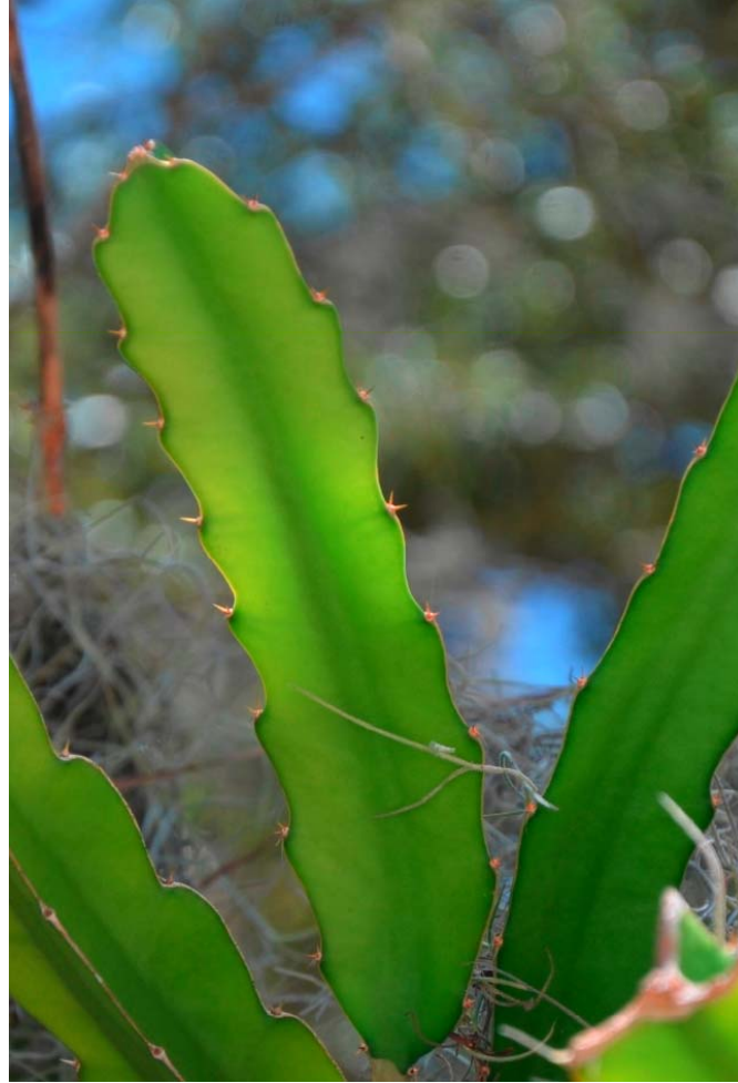
Triangular spiny leaves with undulating margins