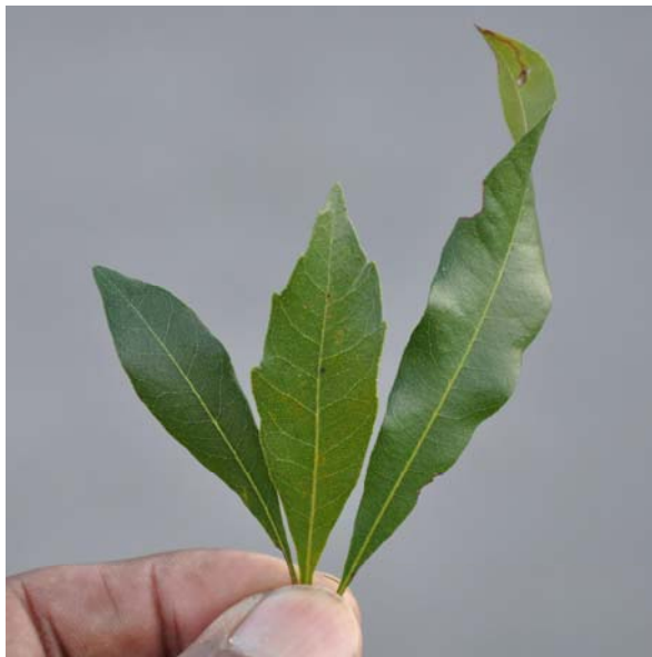
Elliptic to oblanceolate leaves are entire or toothed above the middle. Some are twisted in the upper half.

Propagation is mainly by transplants. Semi hardwood stem tips can also be rooted. Chunks of root mass or suckers can be dug up and transplanted and new growth will quickly develop. By transplanting root mass or suckers from a plant of known gender, the gardener can presumably select plants that will or will not produce drupes as desired. Seeds can be collected in autumn, stratified at 40°F, held for 2 to 3 months and sown in the spring. The seed can also be sown in the fall and covered with 1/4 inch mulch for natural stratification. Seed moisture is essential. Germination takes from 3 to 6 weeks.