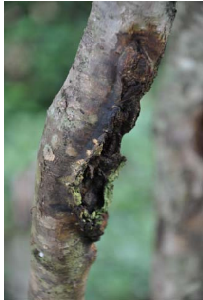
Stem rot on trunk caused by Diplodia corticola