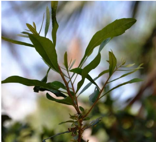
Frequently the terminal bud aborts and is replaced by one or more laterals.

Lenticels are produced on new stems and on young branches. Plants growing in inundated areas often have expanded lenticels and adventitious roots. The bark of the oldest wood is usually mottled gray with hardly a trace of lenticels.