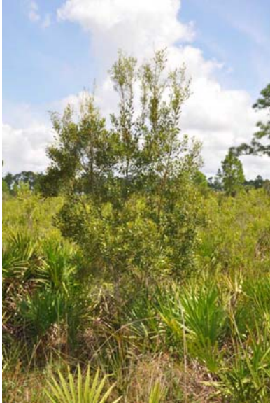
Wax myrtle growing in pine flatland

Wax myrtle ranges widely from Florida Keys, north to southern New Jersey, west to eastern Texas, and southeast Oklahoma. It is also native to Bermuda, the Bahamas, the eastern Caribbean and Central America. In Florida wax myrtle is found in pinelands, swampy areas and other moist sites, often growing behind dunes in the Everglades, where it is a pioneer plant. At lakesides and stream beds it can withstand occasional standing water. It is often used to screen drainage areas, retention ponds and swales.