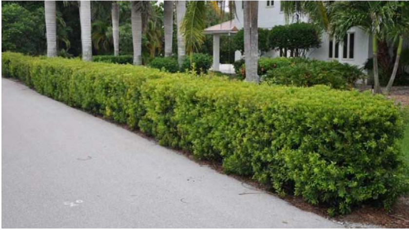
Well tended hedge on Sanibel, FL