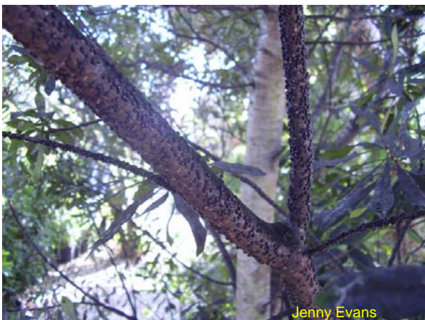
Lobate lac scales on wax myrtle, Sanibel, FL

Pestalotia leaf spot and tip blight were isolated on several plants in Lee County in 2010. The tips of stems and infected bark may be covered in fungal fruiting structures giving the tissue a black sooty appearance. Leaf spots are often the result of previous damage such as scorching or mechanical wounds. Prune and discard affected tissues as feasible when the plant is dry. Fungicide application is rarely recommended. Diplodia corticola is a fungus of wax myrtle and causes dieback of woody ornamentals. Symptoms are more pronounced during the summer. The damage caused by this disease is most severe on old or weakened plants. Old plants exposed to unsuitable growing conditions, mechanical injury, or damage by insects may eventually be killed. Pruning and sanitation should help minimize the disease. Prune off blighted twigs and destroy or discard them. Prune when the tree is dry to avoid transporting fungal spores to healthy twigs. Disinfect pruning tools before each cut. Rake up all blighted leaves, twigs and branches. Fungicides can minimize new infections.