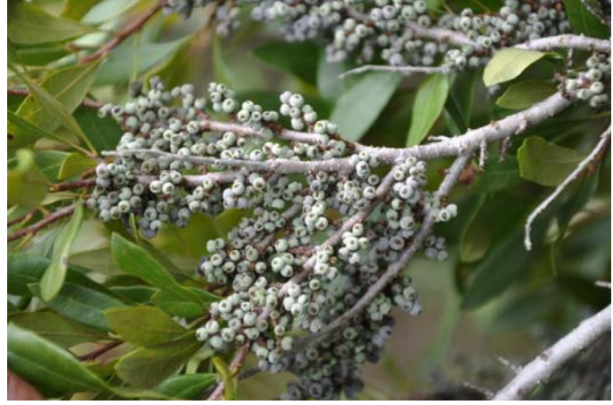
Mature drupes in early November