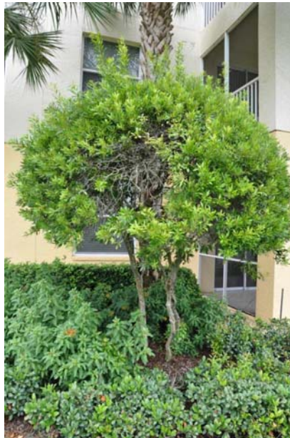
Dead area in canopy caused by Diplodia corticola