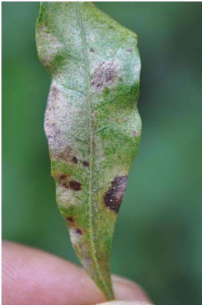
Pestalotia leaf spot on wax myrtle.