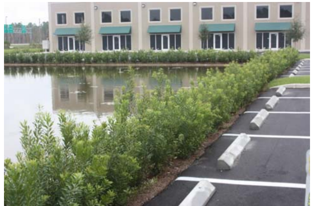
The same hedge in mid-September