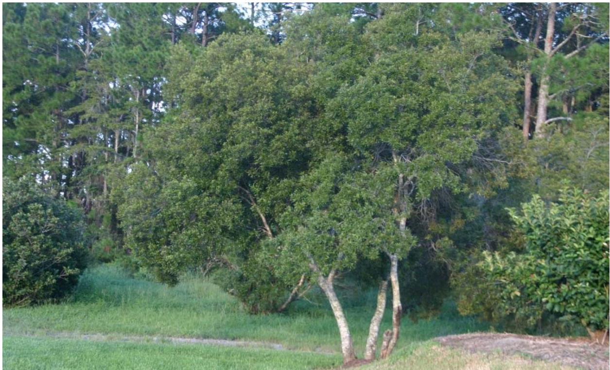
Wax myrtle as a small tree.

Uses: Excellent food and cover for birds and other wildlife.