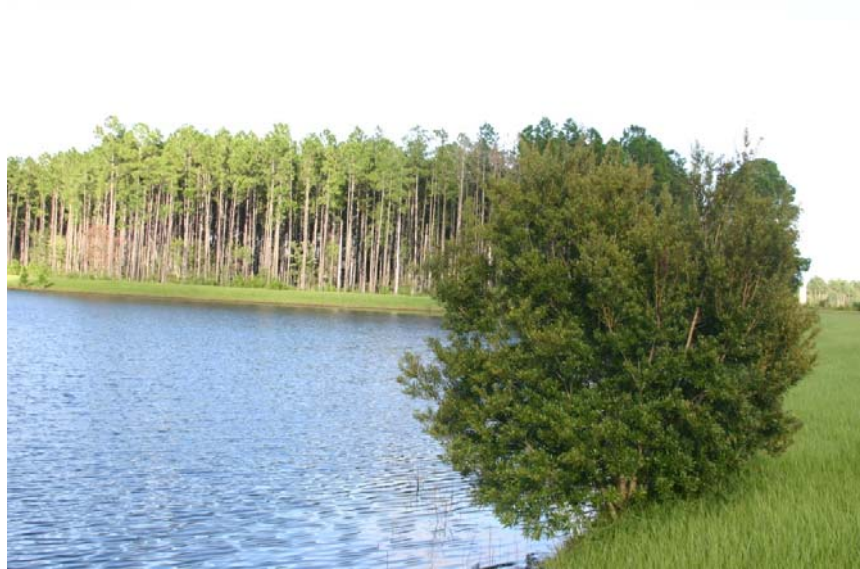
Wax myrtle by the edge of a lake