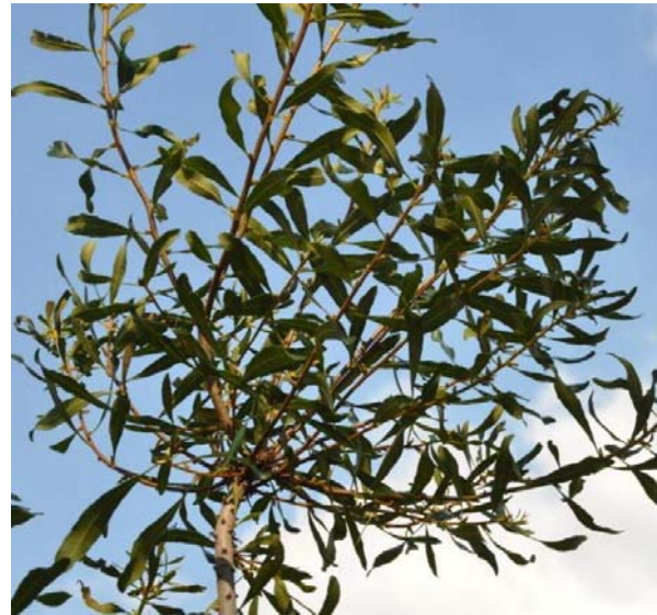
An extreme example of the branching that occurs after the abortion of the terminal bud.