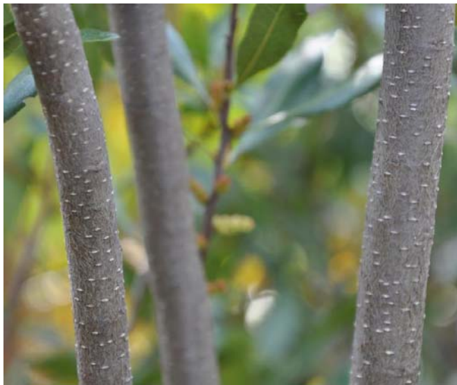
Lenticels populate young stems and branches.