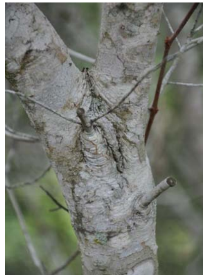
This lichen mottled older trunk has no lenticels