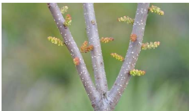
Conelike male catkins on leafless older stems in February