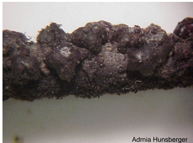
Close up of lobate lac scales on wax myrtle, Miami-Dade County, FL