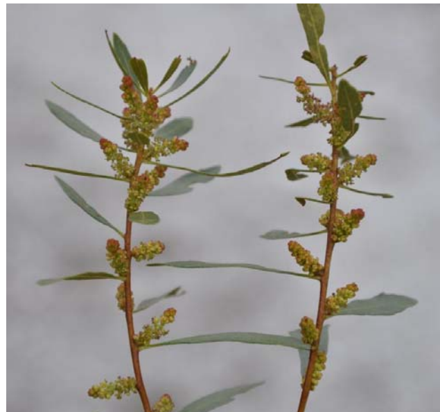
Male catkins, pictured in February, on the leaf axils of last season's stem