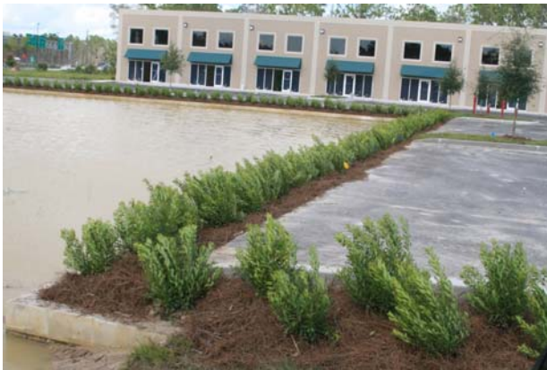
Newly planted hedge in mid-July

Wax myrtle is cold tolerant in all of Florida and can be planted anytime of year in south Florida. It can be used as a specimen shrub, small tree or as a formal or informal hedge. The plant prefers full sun but will grow in partial shade. It is a hardy plant and will adapt to both wet and dry conditions but will need supplemental watering during the dry season. When grown as a shrub or tree it can be trimmed to encourage a denser foliage. Remove unwanted suckers at the same time. Wax myrtle does not take well to frequent and excessive pruning when grown as a hedge. This often causes die out in certain portions of the hedge. To reduce dead areas, allow new leaves and stems to fully form. Consequently, prune in March or April and again in summer and fall, and more if needed. Do not remove more than 1/3 of the plant at any one time and avoid pruning back to leafless stems. The wood tends to be brittle and easily damaged in storms. The species is not particularly long-lived; probably not more than 50 years and much shorter when aggressively pruned.