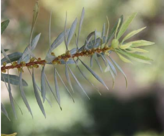
In February, wax myrtle flowers on previous season's growth and produces new vegetative growth on the terminal buds.