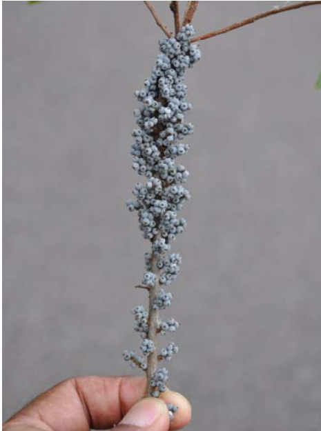
Waxy, bluish green berries were used for candle making in colonial times.

Wax myrtle; southern bayberry; southern wax myrtle; candleberry