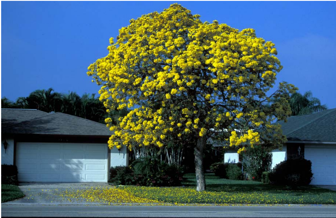
Fort Myers, Florida