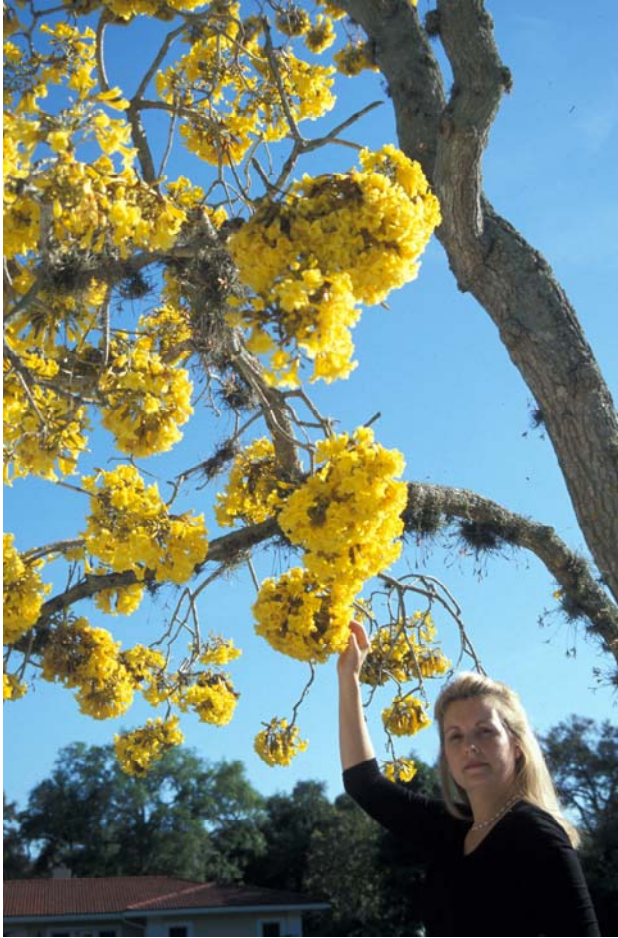
Fort Myers, Florida