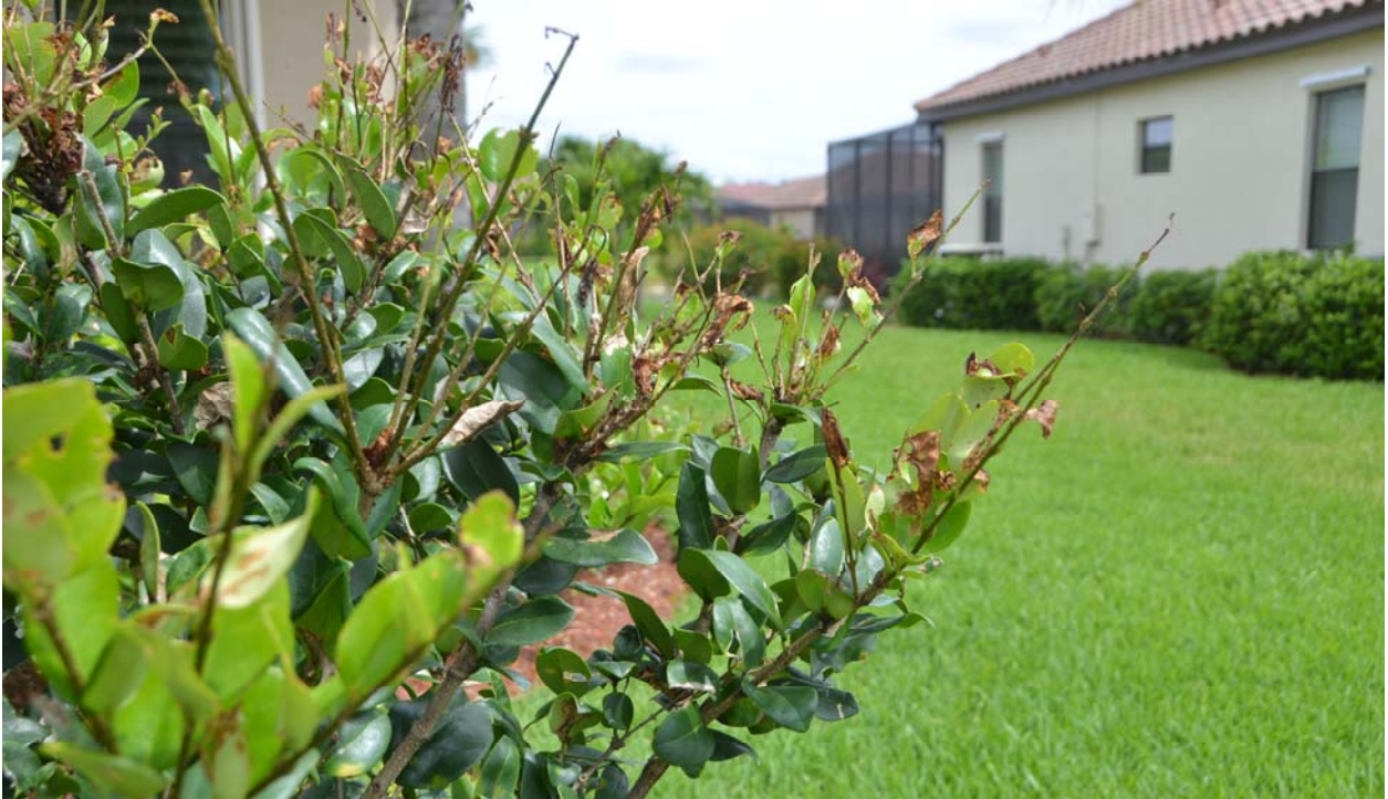
Damaged Ligustrum foliage and stems caused by olive shootworm caterpillars.

Younger larvae consume buds and tender leaves, and older caterpillars may eat older and harder leaves. The feeding causes leafless stems with tip diebacks. Furthermore, they build shapeless frass-laden nests by rolling and tying together stripped and skeletonized leaves with silk. Adults are active by day as well as by night. But being reclusive, they hide under and between the leaves of the host plant and are difficult to detect.