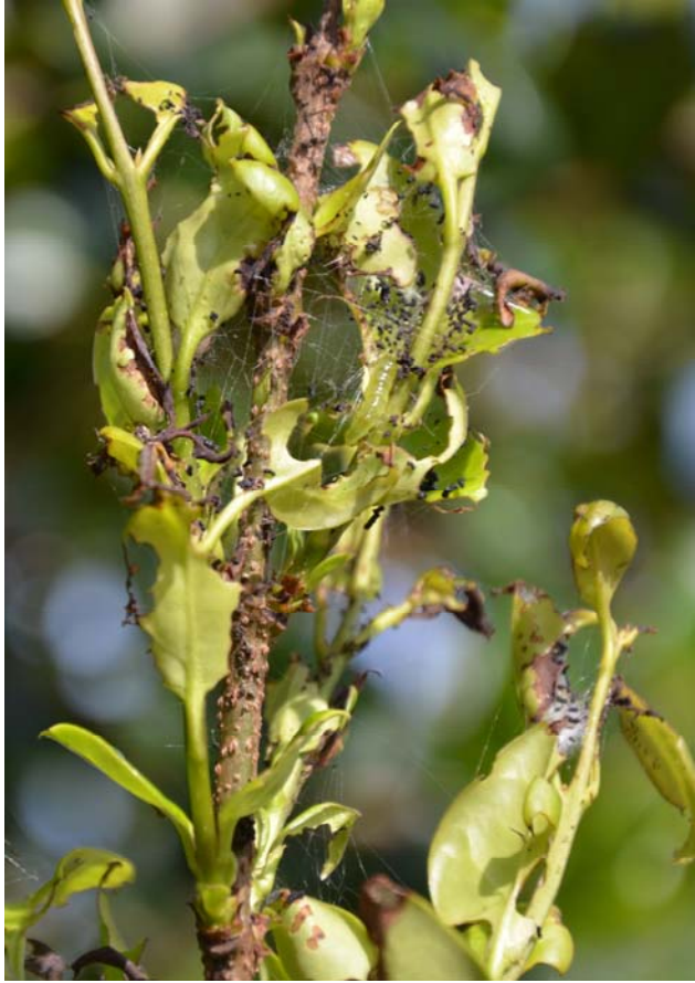
Damage and frass