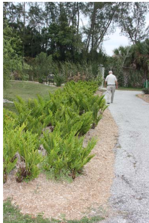
February, two months later