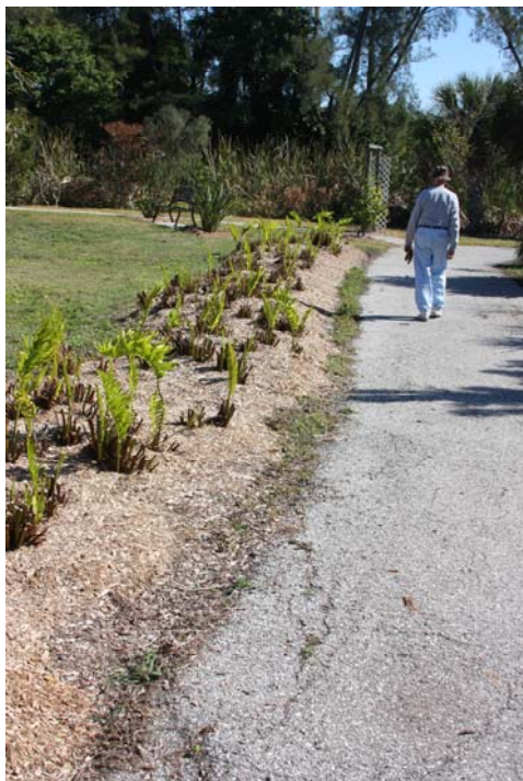
December. Pruned three weeks earlier.

old declining stands. When necessary, severe pruning should be done no more than once a year, at anytime of the year. June is probably the best time to do this as it is the start of the rainy season. This will also allow for the plants to regain their spectacular appearance in time for the arrival of winter visitors. After pruning remove the pruned and dead material. Where it is not subject to inundation, mulch the area after a severe pruning to improve its landscape appearance. In a damp location the giant leather fern requires no fertilization to become established and to maintain its best appearance. However, in drier areas some ferns grow best with regular fertilizer applications. Fertilizer applications of nitrogen and phosphorus should be avoided in the rainy season as prescribed by several county ordinances.