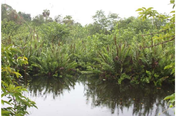
Giant leather fern naturally occurring in fresh water of North Fort Myers.