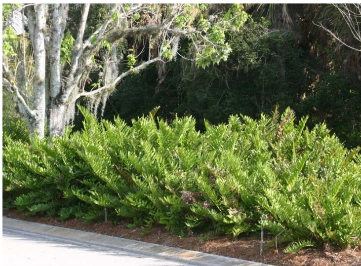
Newly invigorated giant leather fern used as a groundcover in a roadway median of a gated community.