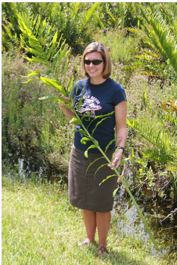
Fronds can be up to 12 feet tall.

Giant leather fern; leather fern; inland leather fern