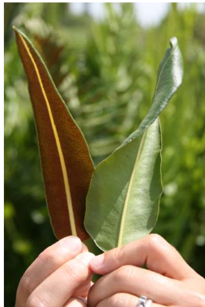
Left: Fertile leaflet covered with a mat of spores Right: Non-fertile leaflet is not capable of spore production.