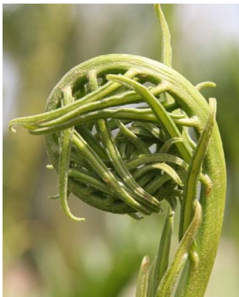
Unfurling new growth in February.

Uses: Aquatic; wet sites; specimen plant; foliage plant; groundcover