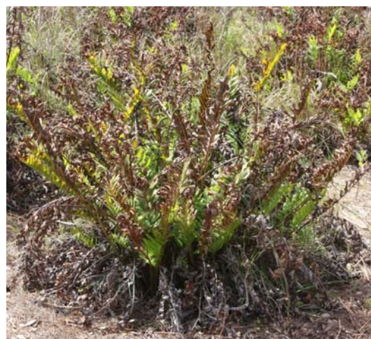
This plant, one of many assigned to a wet swale, has lost its vigor and is in need of pruning and removal of dead material to revive it.