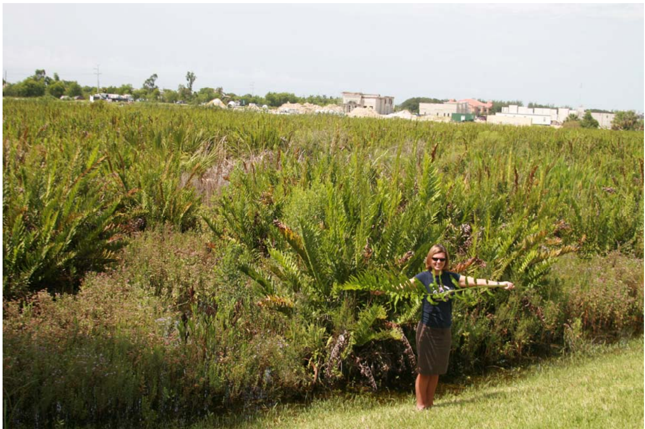
A natural growth of giant leather ferns in south Lee County with an encroaching housing development in the background.

For more Florida Native Plants click on http://lee.ifas.ufl.edu/hort/GardenHome.shtml then click on "Publications A-Z" and scroll down to Native Plants.