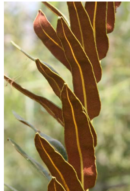
Spores on the underside of the fertile leaflets extends from the top to the bottom of the frond.

Habit of giant leather fern. Fronds can be up to 12 feet tall and 2 feet wide.