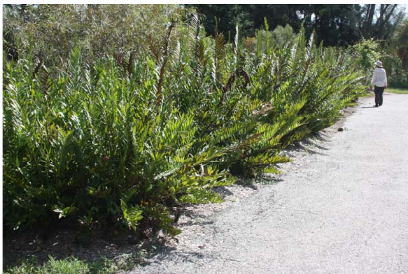
July, seven months later