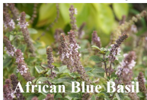
African Blue Basil