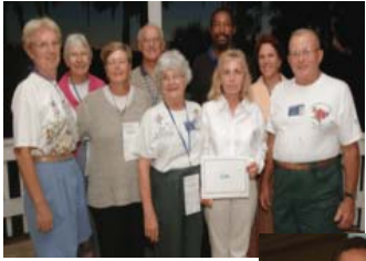
Continuing Education in Gainesville